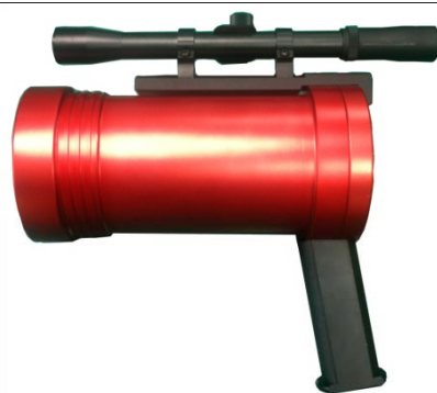
(In case of aiming at detector in hand-grasping)