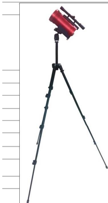
(in case of using the optional tripod)